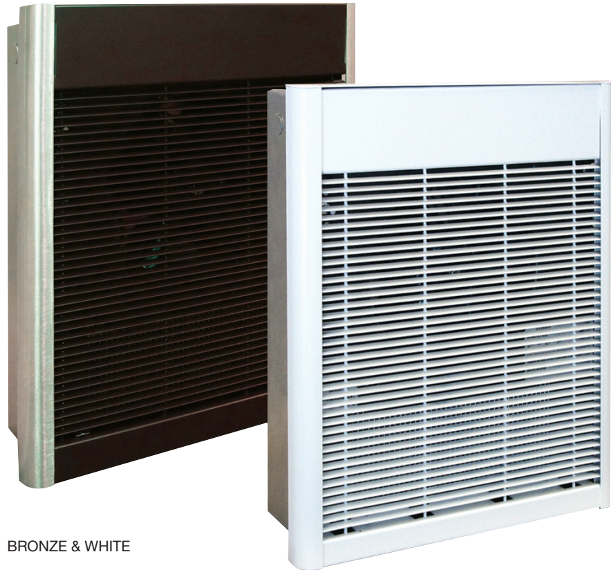
BRONZE & WHITE